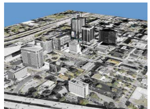
Instantly create 3D building models